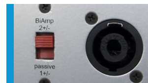
Switchable passive crossover.