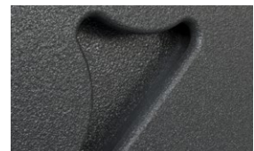
Two large bar handles for easy handling.