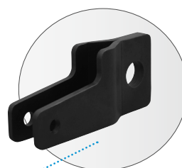
Bottom Pull Adapter