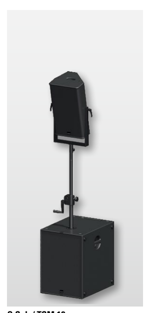
G Sub / TSM 12