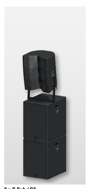
2 x G Sub / G3